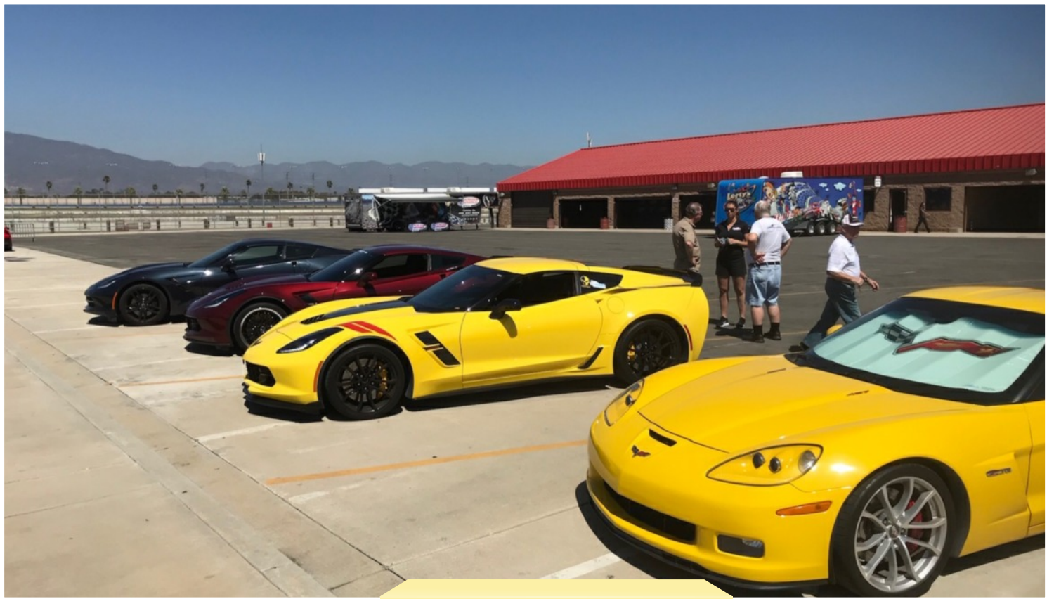
Lefty's Track Day in Fontana